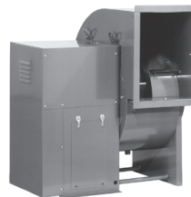
CPS / CPA / CPS-A / CPA-A Shown with weather cover

These COOK products must be ordered with drain and access door to comply with UL requirements. Weather covers are required for outdoor applications. When airstream temperatures are expected to exceed 180°F, high temperature accessories may be required.