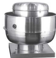
VCR / VCR-HP / VCR-XP / VCRD / VCRD-HP / VCRD-XP

CPV, CPA, CPA-A, QMX, QMX-HP and CIC must be ordered with drain and access door to comply with UL requirements. Weather covers are required for outdoor applications. When airstream temperatures are expected to exceed 180°F, high temperature accessories may be required.