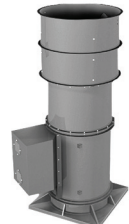
QMXLE / QMXLE-HP