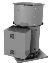
QMXU / QMXU-HP