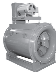
QMX / QMX-HP