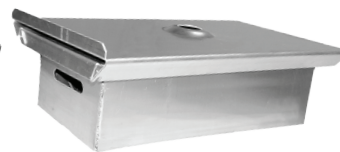
Non-Curb Mounted 'Hanging' Version